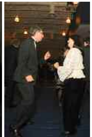
Annual Dinner photos, including cover photo, courtesy of Craig York and York Photography Studio.