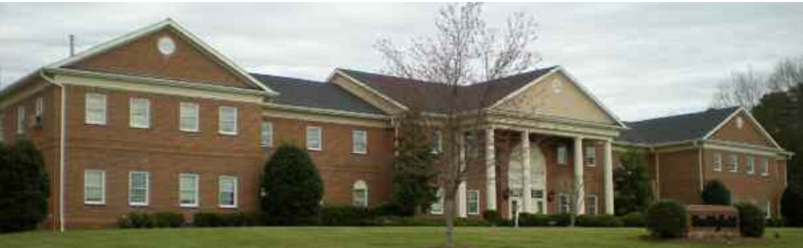
The former Smithfield Foods building will house the new physician assistant program at Elon, as well as the existing physical therapy program.

For additional information and listings of participating lenders, go to www.NCRuralCenter.org or call 919-250-4314.