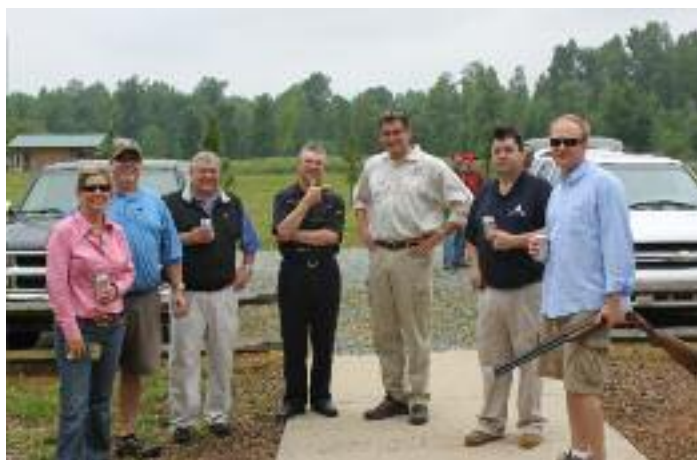
Shooters take a break at May's Chamber Clay Shoot.

SAVE THE DATE Educator Appreciation Expo Friday, August 19