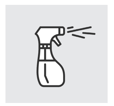
SANITIZE HIGH TRAFFIC AREAS