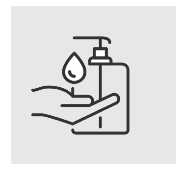
WASH HANDS FREQUENTLY