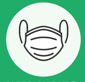
WHO SHOULD WEAR MASKS?

Personal protective equipment is protective clothing, helmets, goggles, or other garments or equipment designed to protect the wearer's body from injury or infection. The hazards addressed by protective equipment include physical, electrical, heat, chemicals, biohazards, and airborne particulate matter. Businesses should keep a minimum quantity of 15-day supply of PPE. PPE can include masks, face shields and gloves.