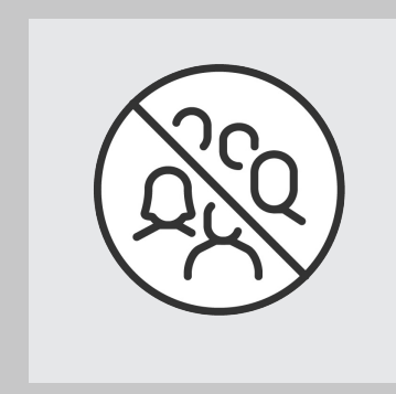
POSTPONE LARGE GATHERINGS