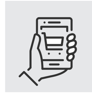
LIMIT CASH HANDLING