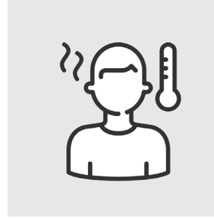
STAY HOME IF YOU'RE SICK