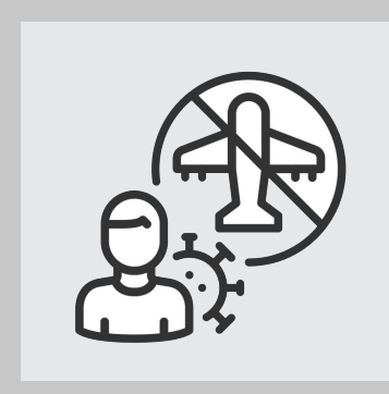
LIMIT BUSINESS TRAVEL